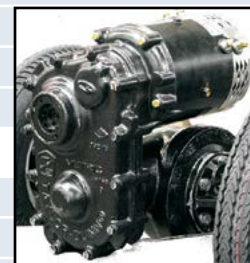
GT Automotive Drive